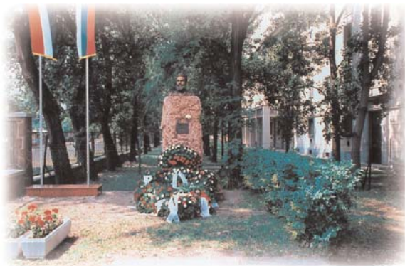
Statue in Budapest of Bulgarian poet Kbristo Botev

history and present-day situation. The organisational framework of these research institutes is very varied: some operate on the basis of a civil initiative, others have contacts with a national self-government or some universities.