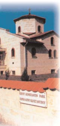
Orthodox church in the Greek village of Beloianisz