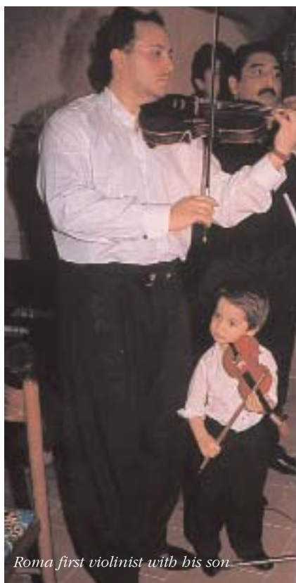
Roma first violinist with his son