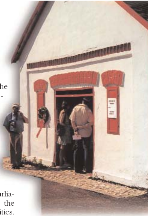
German historical monument cellar in Palkonya (Palkán)

Minority points of view are increasingly taken into consideration in the wording of legislation passed in the Republic of Hungary over the last few years, and modern acts have been created which are fully in line with today's requirements as regards guaranteeing the minorities' basic constitutional rights. Thus for example the Act on Radio and Television Broadcasting states that the public service media have a compulsory responsibility to prepare programmes presenting the culture and life of the minorities and to broadcast in the native languages. A modification (1996) to the Act on the Criminal Code established the prosecution of the criminal forms of racial discrimination.