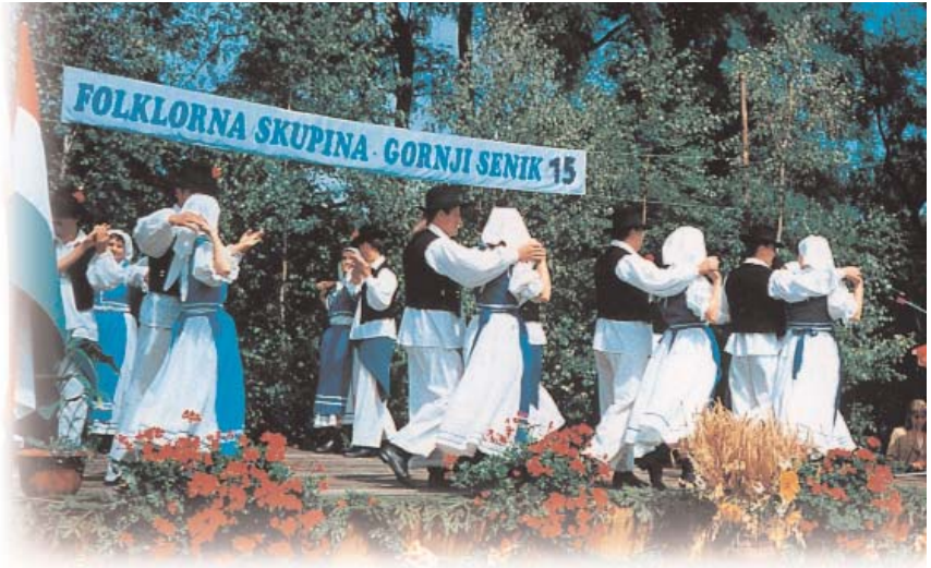
Slovene festival in Felsőszölnök (Gornji Senik)

To a certain extent it is possible to track minority affiliation on the basis of three questions posed in the 1990 census: nationality, native language and spoken language. Answers given by the minorities to these three criteria allow us to draw some conclusions as to ethnic affiliation. Admission of nationality affiliation does not directly presuppose an acquaintance with the native language. By native language, we mean the language acquired during childhood and the language generally spoken in the family, but at the same time a part of the population speaking a minority native language profess themselves to be of Hungarian nationality. Besides these two criteria, additional information can be extracted by taking into account which other languages besides the native language are spoken if the minority language is not a commonly taught, internationally used lan-