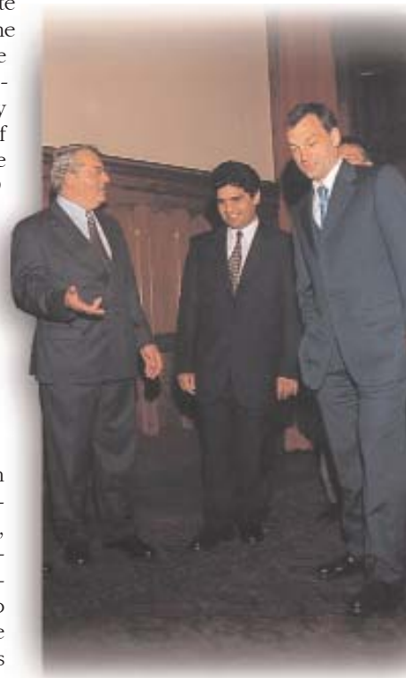
Prime Minister Viktor Orbán (right) receiving Flórián Farkas (centre), President of the National Roma Self-government, on 17 June 1999. Toso Doncsev, President of the Office for National and Ethnic Minorities, is also pictured

Long-term and youth unemployment are also far more common in the Roma community. The problem is only compounded by the fact that large numbers of Roma live in those parts of the country where as a result of industrial structural transformation following the change of regime job opportunities in heavy industry have been severely restricted. The Roma are also frequent-