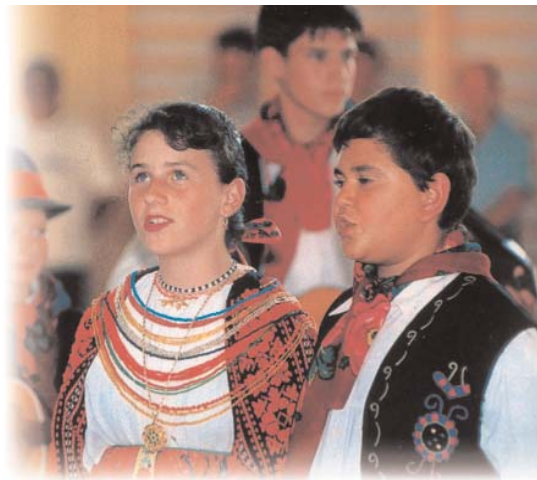
Two youngsters of the Croatian nationality in folk costume