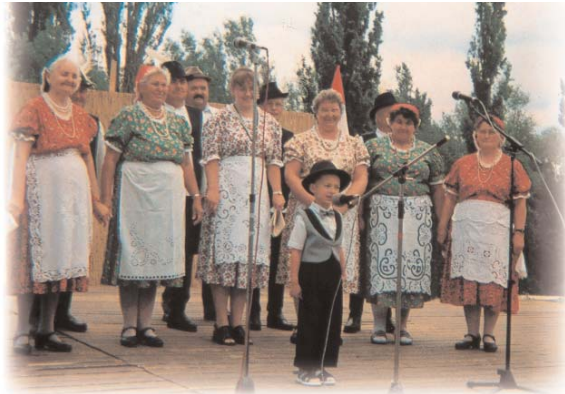
Ruthenian folk singers of Múcsony

budget of the Ministry of the Interior. Support available to minority civil organisations is made on the recommendation of Parliament's Committee for Human Rights, Minority and Religious Affairs.