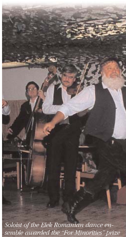
Soloist of the Elek Romanian dance ensemble awarded the "For Minorities" prize

In 1993 Parliament passed Act LXXVII on the Rights of National and Ethnic Minorities, which establishes individual and collective minority rights in the areas of self-government, use of language, public education and culture. Among collective rights, the act states that the minorities have the right to form local and national self-governments.