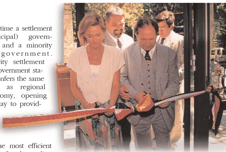
Minister of Justice Iboyla Dávid and German Ambassador Wilfried Gruber opening the Budapest house of Germans in Hungary

Minority education – as a part of the Hungarian public education system – must provide all services that are generally provided by public education as a whole. Moreover, the task is not simply to offer these services in the native language, but it is also necessary to create the conditions for studying the native language and passing on an under-