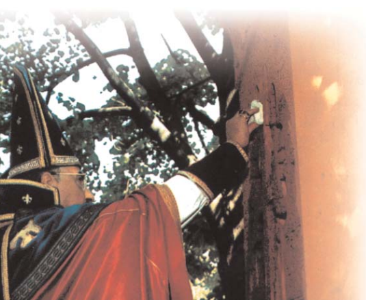
Consecration of the Cross erected in Budapest to mark the 1700th anniversary of Armenian Christianity

nication. Hungarian Radio began transmitting programmes for 13 minorities in 1998, and the public service Hungarian Television also prepares programmes for all the 13 minorities. The native language television programmes for the minorities are complemented by fortnightly Hungarian-language magazine programmes about the minorities which also serve to inform the wider general public. The national self-governments of the national and ethnic minorities independently decide on the principles for the use of the available airtime at their disposal for public service broadcasting.